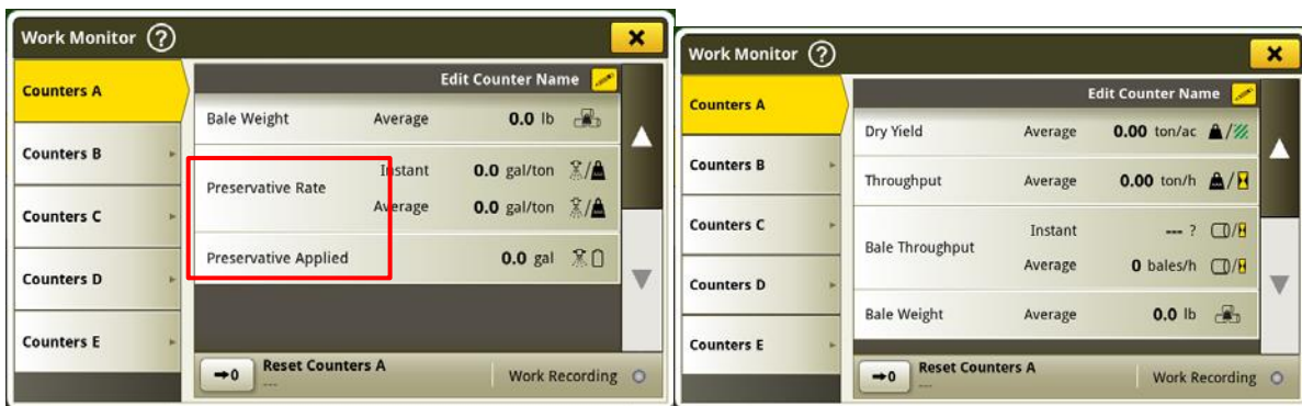
Visible vs. Hidden