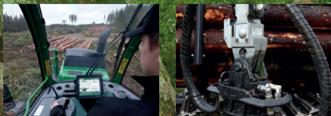
Deere-exclusive SBC and IBC software improves boom accuracy for greater operator control and comfort.