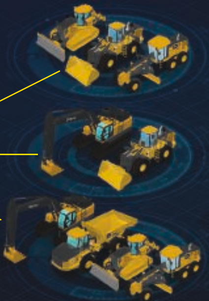
Connected John Deere Machines

John Deere Connected Support minimizes downtime through machine-health monitoring and remote diagnostics and programming . JDLink connectivity simplifies the delivery of real-time data to and from your equipment, and also enables remote support services. Whether it's dealers monitoring machine health and proactively working to prevent equipment downtime, technicians arriving at the jobsite with the correct repair part in hand, or customers leveraging the JDLink mobile app for basic operating info, John Deere Connected Support is all about keeping your machines working.