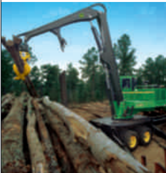
The 437C load-sense system features two-pump variable displacement with dedicated swing pump for significant reduction in fuel consumption and noise levels.

And, while other machines share hydraulic flow with all functions equally, the 437C offers multi-functioning with main and stick functions as one section, and swing functions as another. It’s load sensing that not only improves your uptime and productivity, it just makes sense.