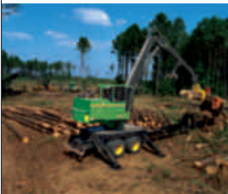
The 437C shares a common platform and engine with the 335C and 435C creating consistency across the line.