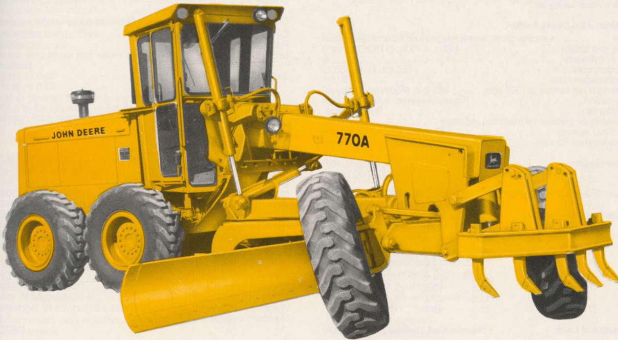
Model shown may include options